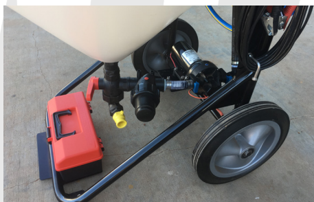
12v Pickling Pot

The spray bar allows you to apply seed dressing through jets or an orifice plate using pressure to regulate the flow. Spray bar is not recommended to be used for peat based inoculant.