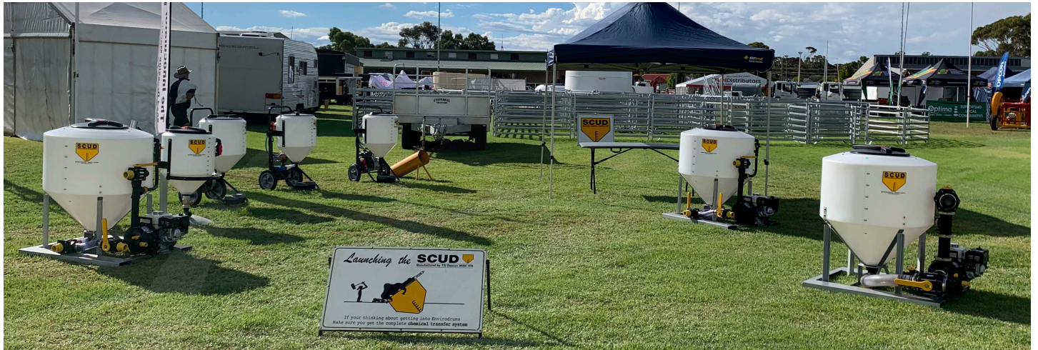
SCUD tank rinse