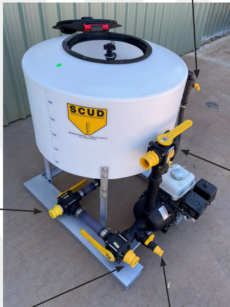
2" chemical suction